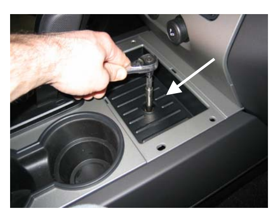
Replace hex head screw on accessory pocket